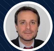
Fabrizio Sarrica Research Expert, United Nations Office on Drugs and Crime