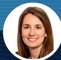
Laura Ferrara Member of the European Parliament (LIBE Committee)